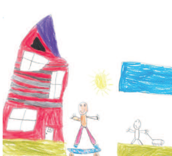
Town school, 5/7 year old boy. "I am skateboarding outside my house" and "My mum and I are walking the dog."