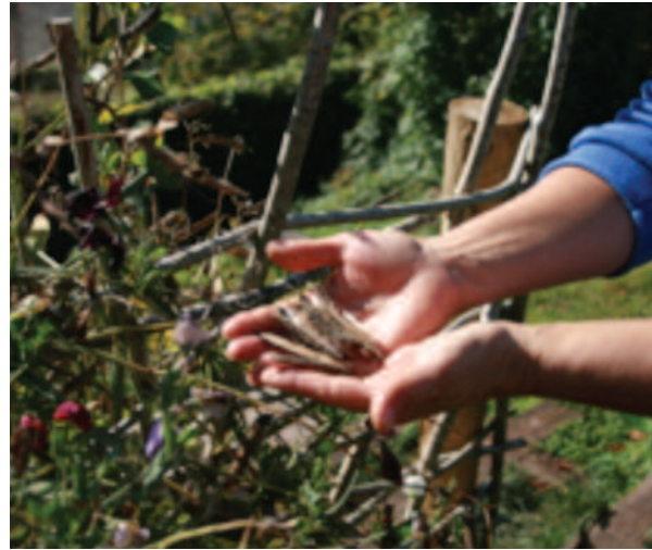
City school garden

spaces around their houses where they played, often with pets, and which sometimes also provided opportunities for reflection and observation: