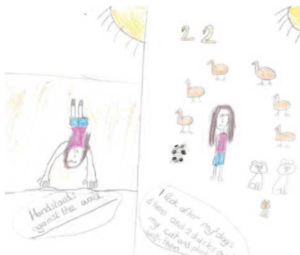
Town school 10/12 year old girl. "Handstands against the wall" and "I look after my 3 dogs, 6 hens and 2 ducks and my cat and play with them."

Television and computer use was also a point of difference. Of the twenty-four city children whose pictures were included, two depicted television (one in twelve), while eleven included images of computers and games consoles (one in two).