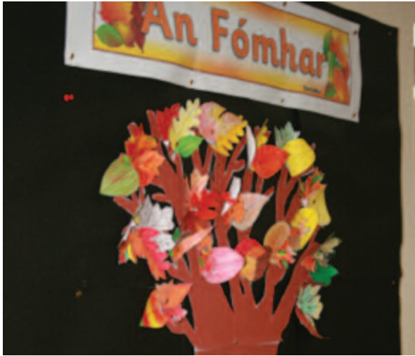
Artwork in rural school