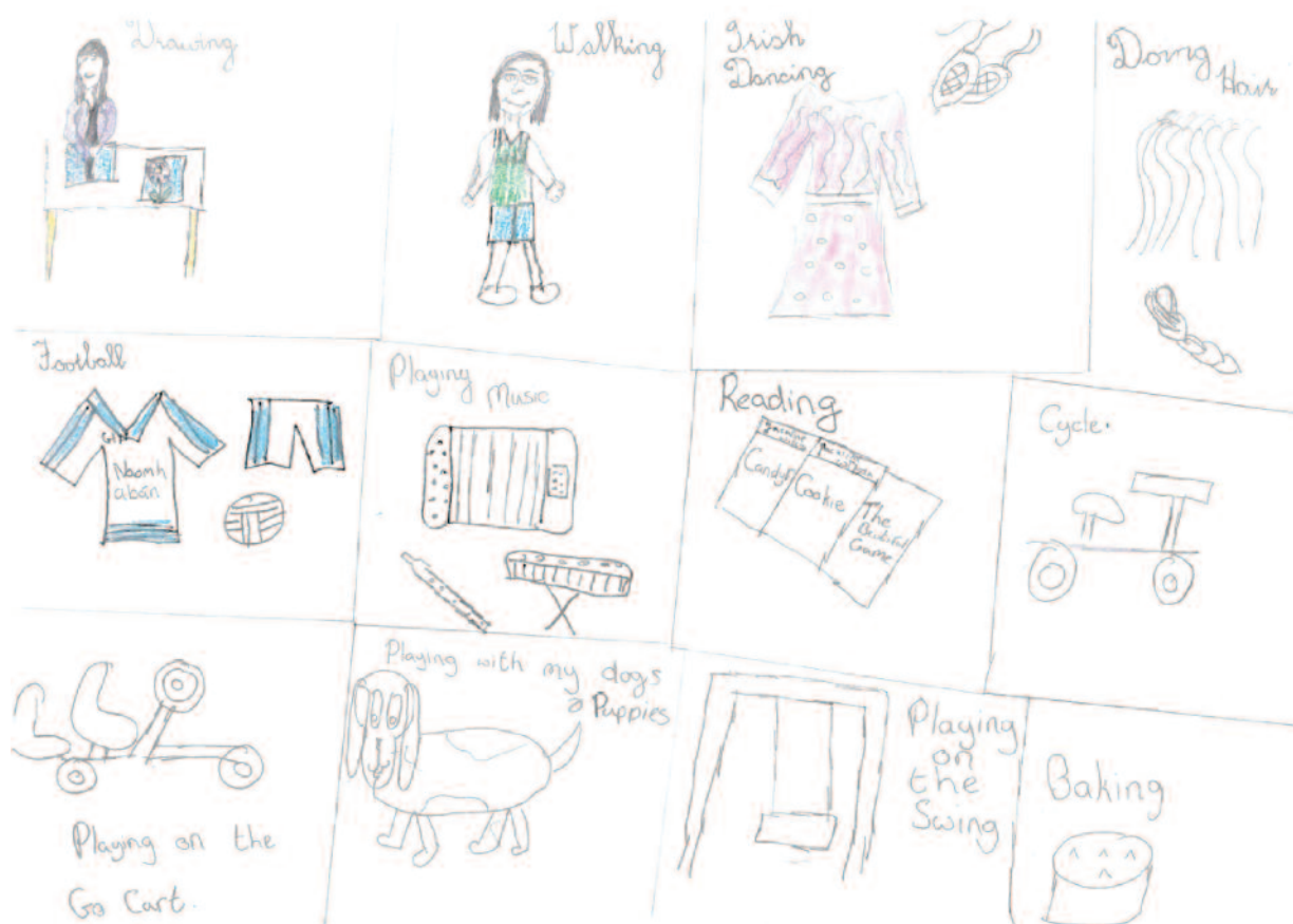
Rural school, 10/12 year old girl. "Drawing, walking, Irish dancing, doing hair, football, playing music, reading, cycle, playing on the go-cart, playing with my dog and puppies, playing on the swing, baking."

In the rural setting, among the thirty-five children whose drawings were included, there were five images of television watching (one in seven), and seven of computer or games console use (one in five). None of the two younger age groups in the town setting included television in their drawings, while almost half of the oldest group did (one in two). Computer use was low in all town groups, present in just one of the twenty-one Senior Infants', five of the nineteen second class (one in four), and just four of the 20 fifth class pictures (one in five). As shown in the table below, in the absence of prompts from the researchers, few children (6) spontaneously depicted nature. See further Table 4 in the Appendices.